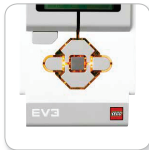
Brick Status Light – Orange