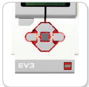
Brick Status Light – Red

You can also program the Brick Status Light to show different colors and to pulse when different conditions are met (learn more about using the Brick Status Light Block in the EV3 Software Help).